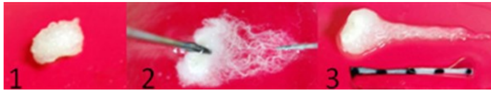
Figure 3. Cultured ovule (1) is soaked in 75% ethanol (2) to separate fiber and measured on a glass slide (3)

automation of the measurement (e.g. Image J).