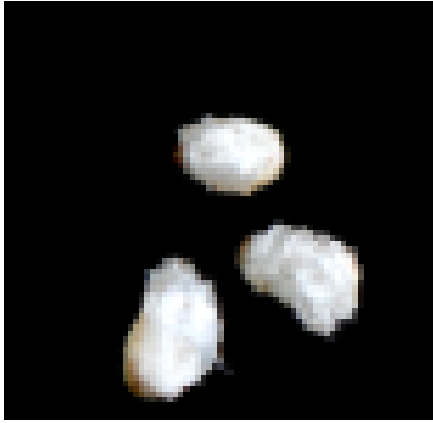
Figure 2. 0 DPA ovules after 5 days culture