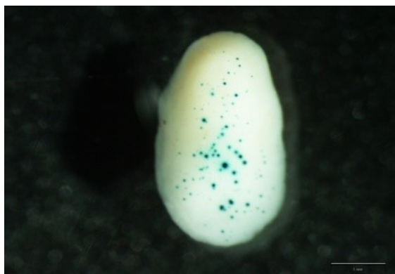
Figure 1. Maize embryos bombarded with a promoter with a medium-low expression level