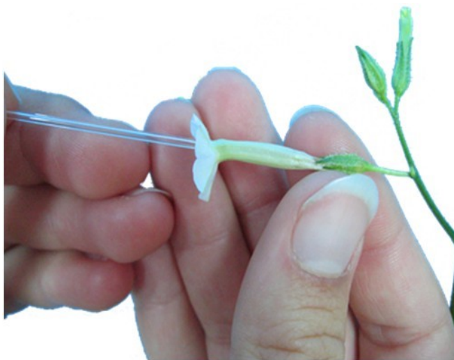
Figure 1. Floral nectar collection with a glass capillary