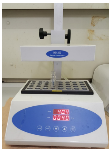
Figure 2. Evaporation of sample at 40 °C under a stream of nitrogen using sample concentrator (MD200-2). The spray nozzle was inserted into a glass tube which was placed to aluminum dry bath heating block. Sample was dried at 40 °C under nitrogen gas.