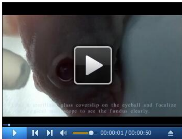
Video 1. Intravitreal injection of uveal melanoma cells