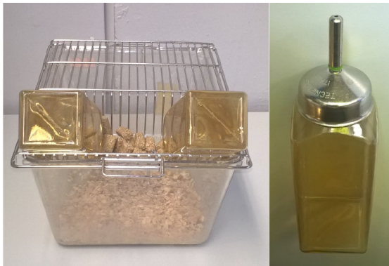
Figure 1. Mouse cage with two bearing sipper bottles