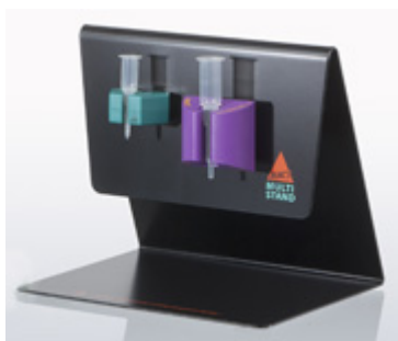
Figure 1. MACS midi system for cell purification