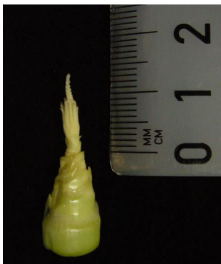
Figure 2. Immature maize tassel at time point of EdU treatment