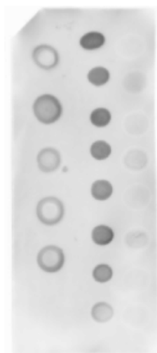
Figure 3. An example of a failed PI4P detection assay. Lipids were spotted onto the membrane together with the debris left over in the extraction step (the pellet at step C2). It prevented binding of PI(4)P Detector to PI4P and thus spots were detected as rings instead of circles.