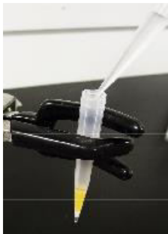
Figure 1. Partial purification of Ba(OH) 2 hydrolysate. Supernatant of the Ba(OH) 2 hydrolysate of the galactosylated peptide was applied to the tip column.