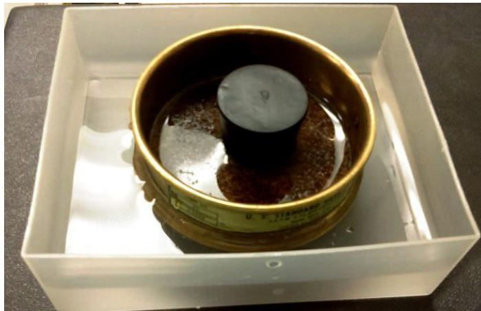
Figure 5. The females and cysts placed on top of an autoclaved 350 ml plate to release the eggs

below. Crush the females and cysts for 5 to 10 min. When the water is cloudy, switch sieve to a new autoclaved 4 cm deep plastic plate (lid of pipet tip box) with fresh sterile ddH 2 O. Crush again. Check the progress of crushing of the females under the microscope. When finished crushing, pour the solution through a 3 inch diameter #250 nested with a #500 sieve. The #250 sieve catches the female and cyst shells. The #500 sieve contains the purified eggs, while the small debris flows through the #500 sieve.