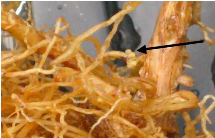
Figure 2. A. Soybean roots containing SCN. (Arrow indicates nematode cyst)