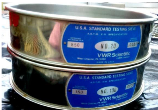
Figure 3. Nested sieves, #20 on top and #100 on the bottom