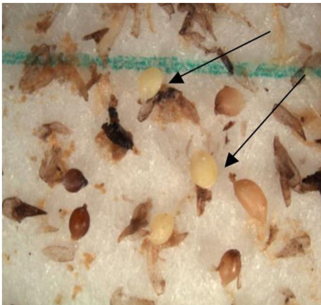
Figure 7. Cysts of SCN collected on lined Whatman filter paper