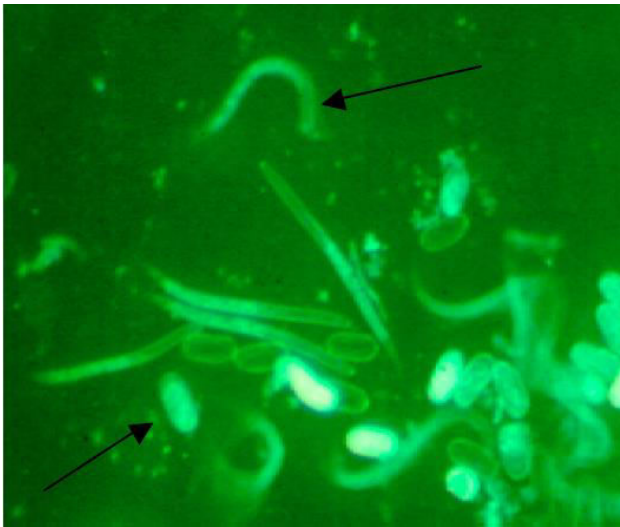
Figure 6. Hatched J2 juvenile nematodes and eggs