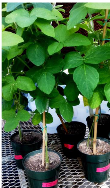
Figure 1. Culture pots containing soybean plants inoculated with soybean cyst nematodes