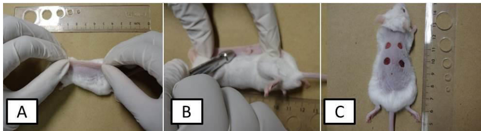
Figure 1. Stepwise skin excisional wounding surgery. Fold and raise the dorsal skin cranially and caudally at midline to form a sandwiched skinfold (A). Place the animal in a lateral position and punch through the folded skin (B) to create symmetrical full-thickness excisional wounds (C).