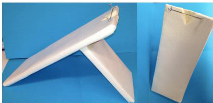
Figure 1. Representative Model of Intubating Platform