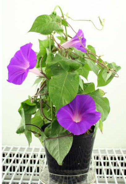
Figure 3. A Violet plant after 11 weeks in a growth chamber