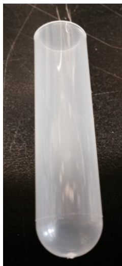
Figure 2. Beckman ultracentrifuge tubes. Ultracentrifugation tubes utilized to pellet vesicles.