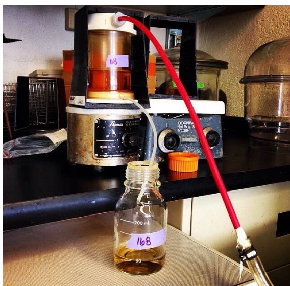
Figure 1. Amicon ultrafiltration setup. The ultrafiltration cells are connected to compressed nitrogen gas. The gas applies pressure, forcing the supernatant through the 100 kDa filter membrane. Vesicles stay in the concentrated supernatant while smaller proteins and liquid supernatant flow into waste container.