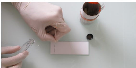
Figure 1. Loading the lipid samples with a capillary tube directly at the origin of the TLC plate