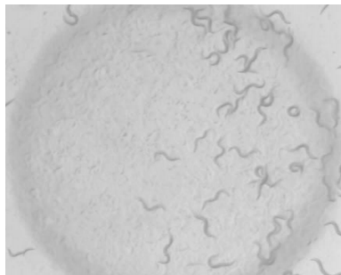
Figure 2. Final picture of the E. coli drop of a plate showing high response to 1-octanol